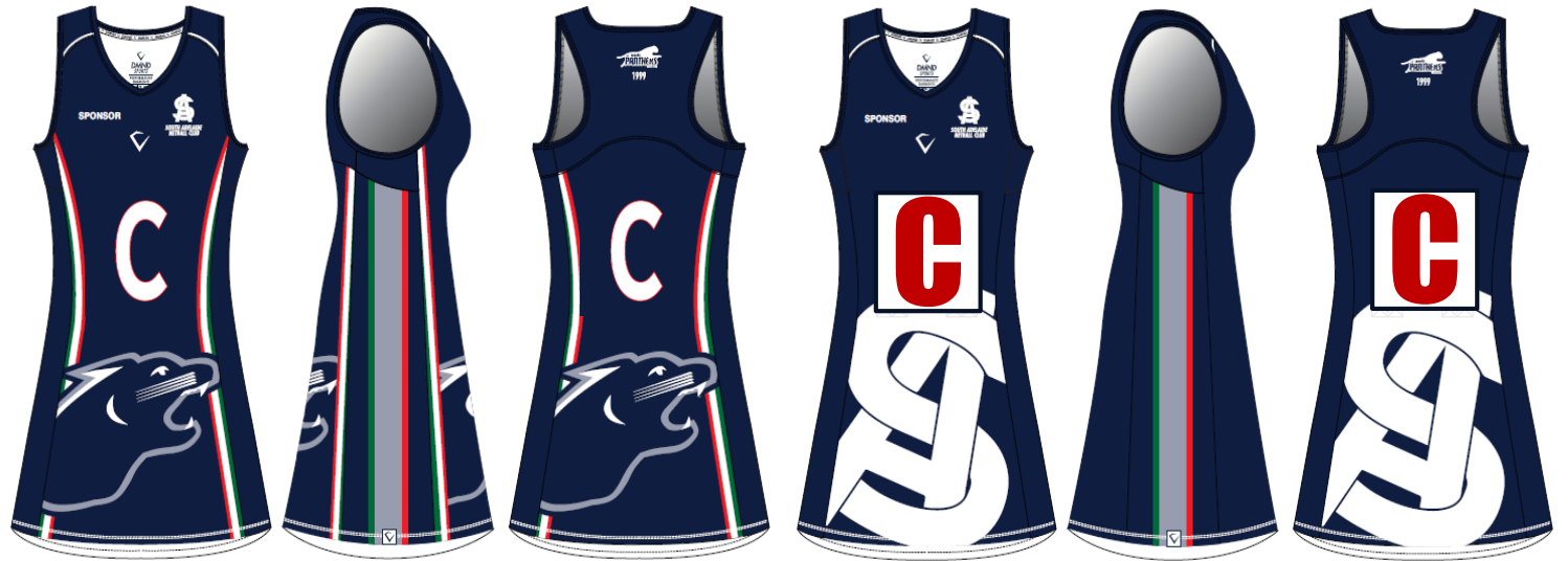
Premier League Dress